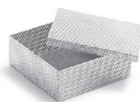
Basket for burs and small parts