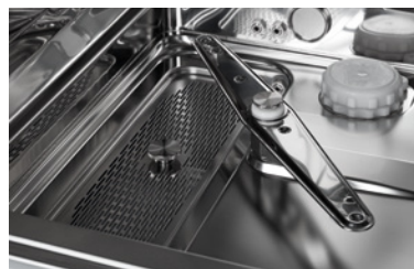
Injection washing system