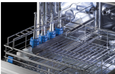
Support with wand holders