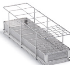
Insert for vertically positioned instruments