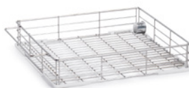
Standard load basket