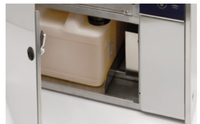
Chemical liquid dispensing system